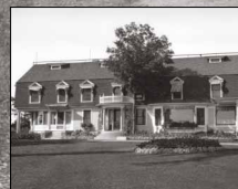
The Cottage, 1910.