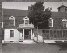
Heart's Delight Cottage, 1905.