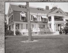
Summer at Heart's Delight, 1913.