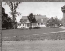
The Cottage and House Tower, 1906.