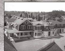
The north side of the Cottage.