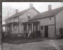
Farmhouse prior to renovation.