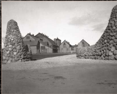
Main gates to Heart's Delight Farm, 1906.

Farm buildings were erected quickly, usually six to ten large structures per year. If you had peeked through the stone gate entrance in 1906, you would have seen the Dairy Barns being built to the right of the gates, two piggeries straight ahead, and the Coach and Big Barns on the left. Hidden behind the right stone gate is the Storehouse, our present Heritage Center. If you drove to the left past the Coach Barns, you would find yourself at Heart's Delight