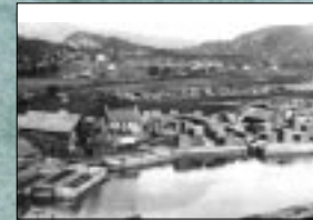
During the 19 th century, sailing vessels and canal boats brought lumber from Canada to be planed in the mills of Whitehall Harbor and shipped south. Pulp wood was also a large cargo.

Artist unknown.