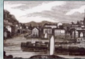
Whitehall Harbor in 1823, the year the canal was completed to Waterford.

To learn more about the canal and Whitehall history, follow the towpath to the right, past the stone walls of the original canal, to the Whitehall Urban Cultural Park Visitors Center.