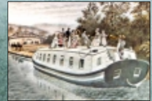
Before the arrival of the railroad during the mid-19 th century, passengers enjoyed travel between Whitehall and the Hudson River on horse-drawn packet boats.