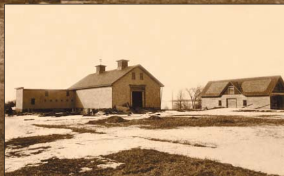
In 1883, when the Webbs came to Oakledge, the barn was a far simpler building. Can you pick out what the Webbs changed and what they left alone?