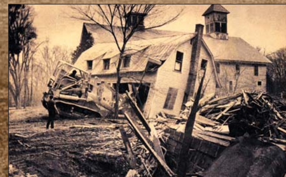
After many years of use, the barn and garage gave way to bulldozers in May 1975, making space for the Ledgewood development.