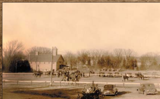
The Burlington Riding Club used the Oakledge barn for events, including this get-together on November 26, 1939.