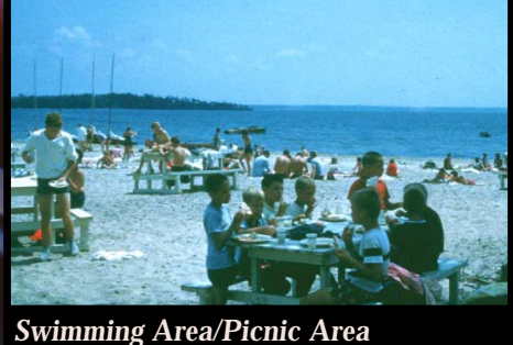
Swimming Area/Picnic Area