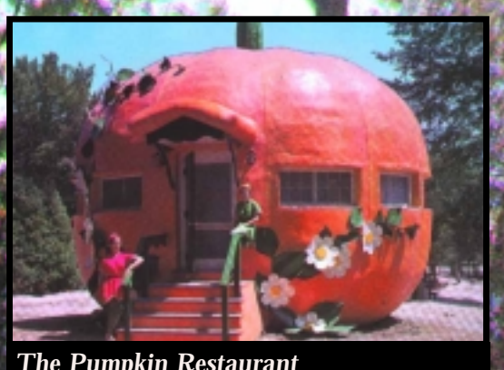
The Pumpkin Restaurant

Main photograph: "The Homes of the Three Little Pigs."