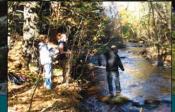
Water quality monitoring along Potash Brook