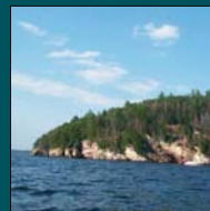
(3) Red Rocks Park