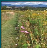
(2) South Burlington Garden Club