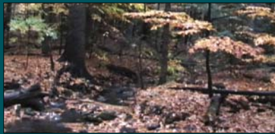
(1) Potash Brook