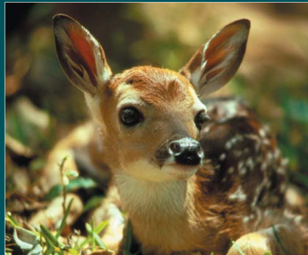
White-tailed deer make their home in this area.