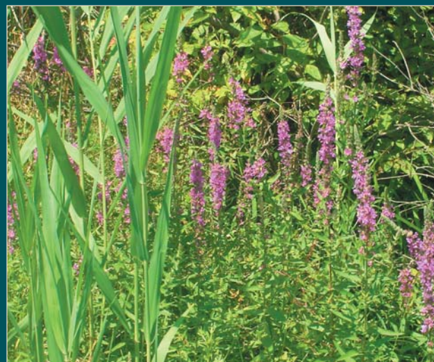
Purple loosestrife, an unwanted invader!